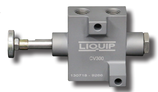
CV300 model shown

Commonly mounted to the GC300 series guard bar, VCM450 vapour adaptor and API490 series adaptor.