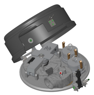
HWC451C shown on VOH451 series hatch