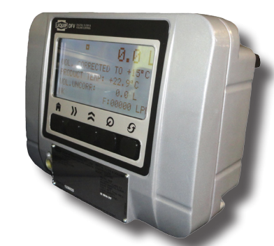
DFV10x Model Shown

The DFV100 is approved for use in hazardous areas (Zone 1) either truck mounted or fixed site product transfer applications. The DFV100 is NMI approved for all commonly used pulsers and meters. 500mm